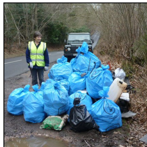
Frant's 2018 litter haul

The campaign will run for a month from 22 March to 23 April 2019 so there is plenty of time to mobilise your communities and arrange your litter pick. So save the date for the 2019 Great