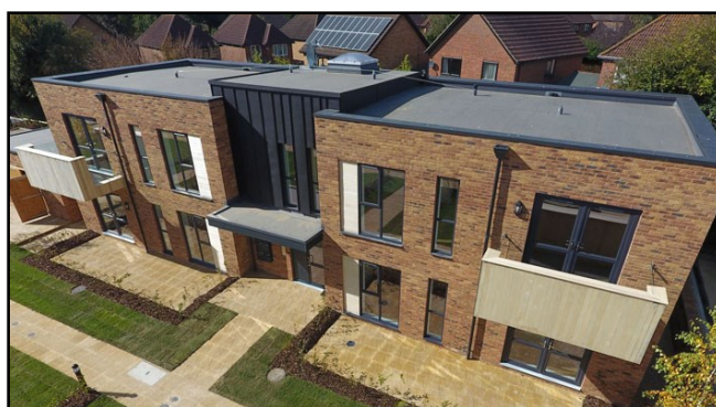
Recently completed: Old Hop Gardens.

In its recent Housing Green Paper, the Government announced that it would not be expecting local authorities to sell off their high value council houses to fund the provision of